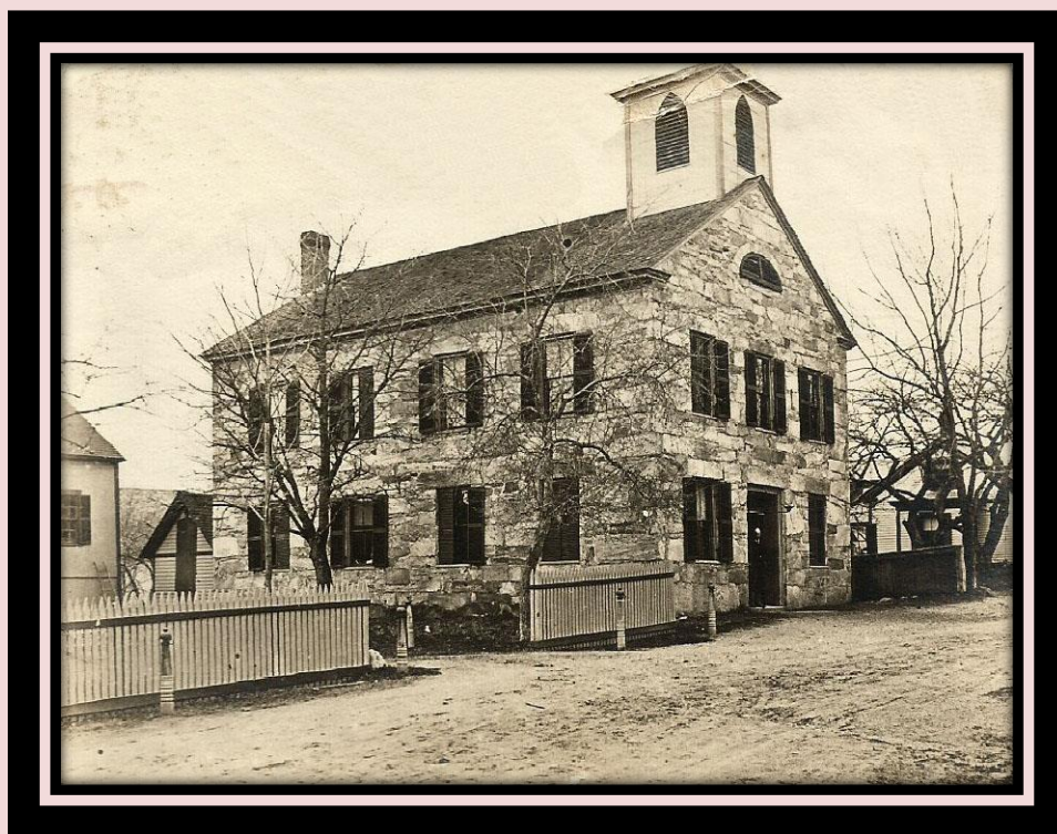
TOWN HALL Boylston, Massachusetts 1905