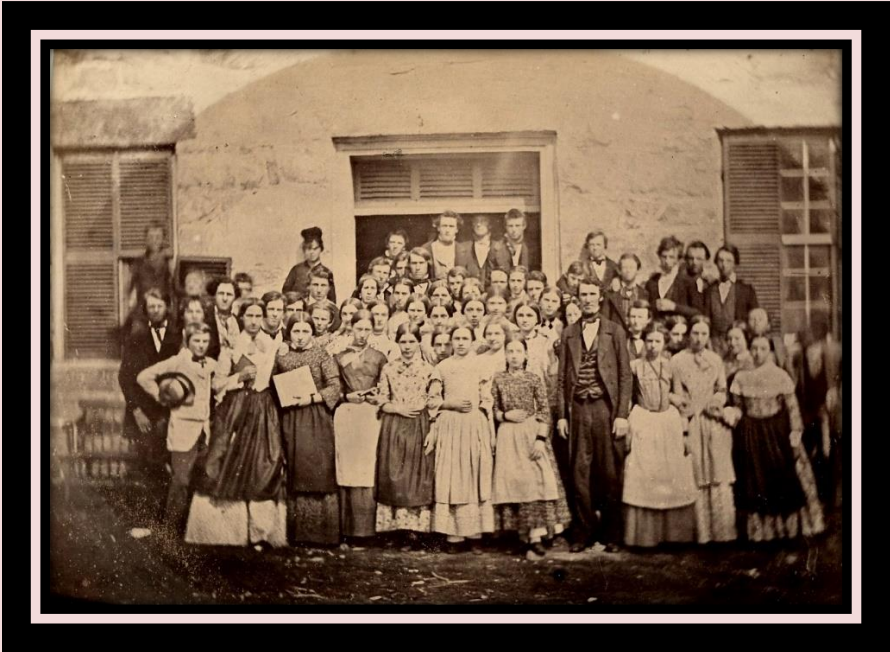
CLASS OF 1852