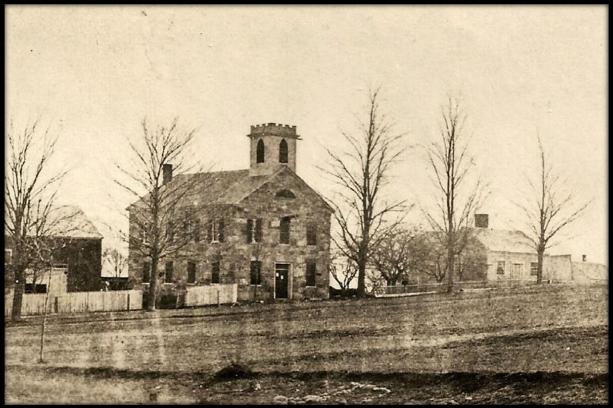
TOWN HALL Boylston, Massachusetts 1870